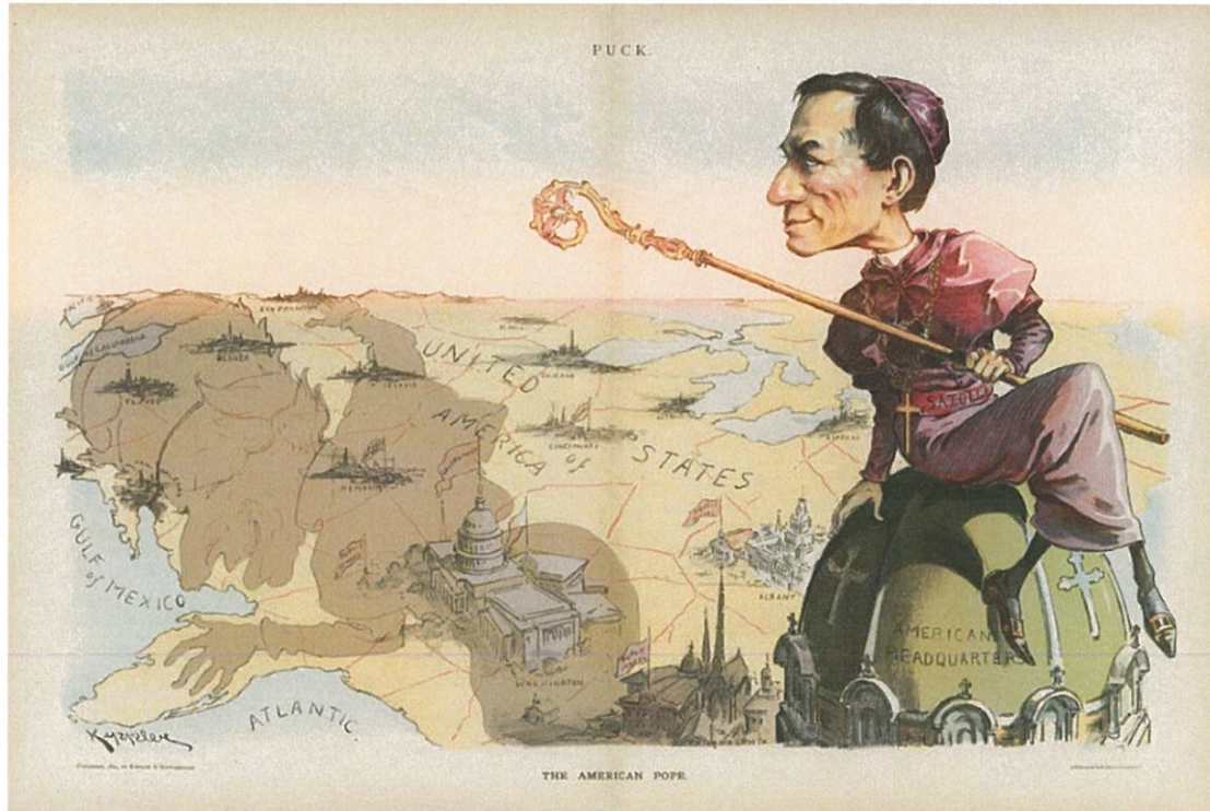
Anti-Catholic attitudes greatly influenced the United States in the nineteenth century. This anti-Catholic cartoon from 1894 shows Archbishop Francesco Satolli casting a shadow over the United States.

Many new immigrants worked as agricultural laborers, while others settled in cities and worked as servants or in factories. Others began to settle and look for employment in the West. East Asian immigrants often arrived on the West Coast, while many European immigrants traveled from the East Coast to